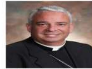
Archbishop Nelson Perez Archbishop of Philadelphia