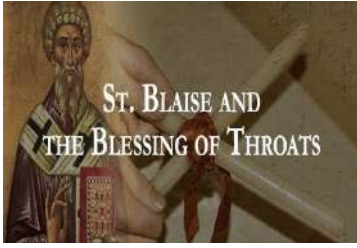
ST. BLAISE AND THE BLESSING OF THROATS

Feast of Saint Blaise - The Blessing of Throats will take place at the 8:00 am Mass on Friday, February 3 rd .