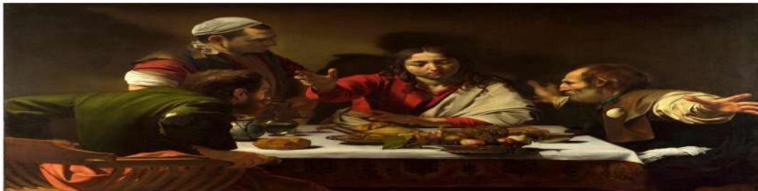
Supper at Emmaus by Michelangelo Caravaggio – National Gallery, London