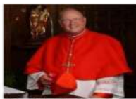
Cardinal Timothy Dolan Archbishop of New York, Author

Man Up Philly 2023 invites the men of the Archdiocese Of Philadelphia to the 15 th Annual Men's Spirituality Conference to be held IN PERSON on Saturday, March 4 th at Cardinal O'Hara High School.